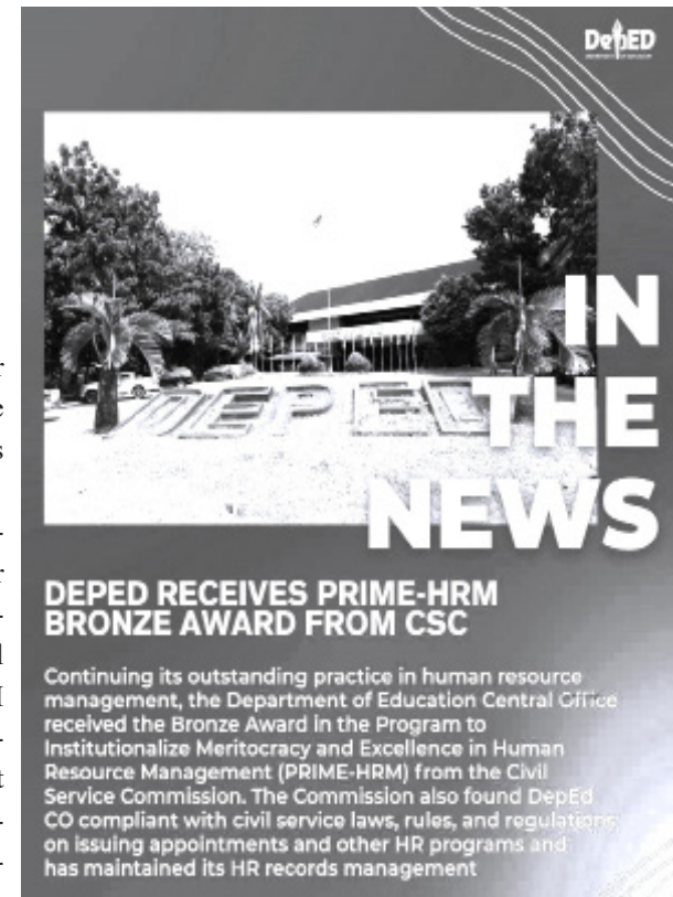
Continuing its outstanding practice in human resource management, the Department of Education Central Office received the Bronze Award in the Program to Institutionalize Meritocracy and Excellence in Human Resource Management (PRIME-HRM) from the Civil Service Commission. The Commission also found DepEd CO compliant with civil service laws, rules, and regulations on issuing appointments and other HR programs and has maintained its HR records management.

Meanwhile, DepEd CO is now responsible for maintaining the PRIME-HRM status under Level 2 and improving its HRM systems to meet the maturity indicators of the next higher level. The Department should likewise continue to comply with the civil service laws, rules, and regulations in the issuance of appointments and implementation of other HR actions and partner